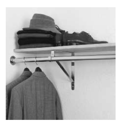
Shelf not included.