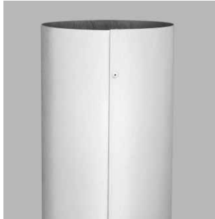
Shown in Satin Finish St. St.