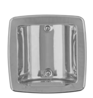
Shown with Bright Finish Model 821B