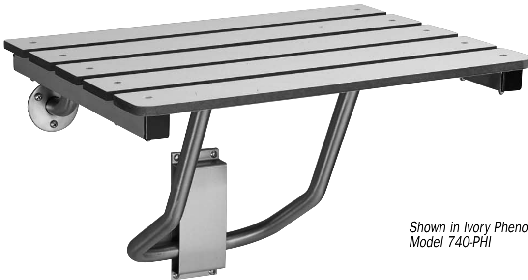
Shown in Ivory Phenolic, Model 740-PHI