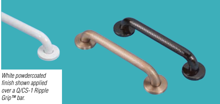
For a striking, dramatic look to any grab bar, add plating over Ripple Grip™. Satin Copper and Black Nickel, both shown in Q/CS-1.

Applied surfaces need little maintenance – wipe gently with a soft cloth dampened with water to keep the finish clean and glossy. All TSM plated finishes have a clear baked enamel coat to protect them.