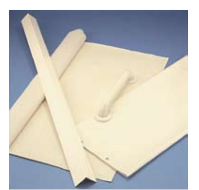
Coordinated colors in Almond featuring Naugahyde® seat cushion material, Lexan corner guard, grab bar and vinyl shower curtain.