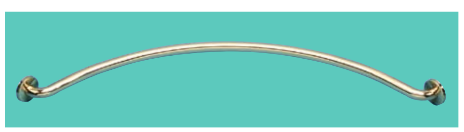
Custom Brass Grab Bar with 27" Radius and 48" Arc.