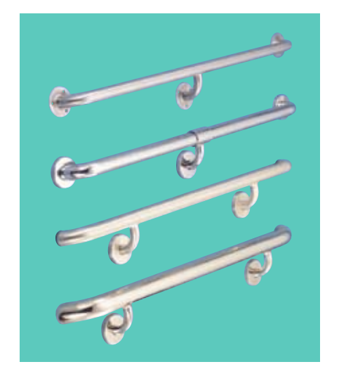
TSM offers a wide range of railing systems in all sizes of stainless steel, brass, aluminum and bronze. Please request Catalog 804 featuring architectural metalwork and ornamental handrails, both in off-the-shelf systems as well as custom fabrications.